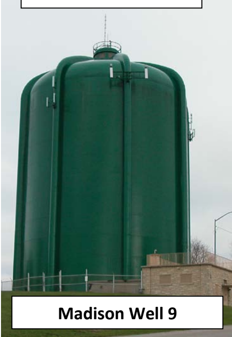
Madison Well 9