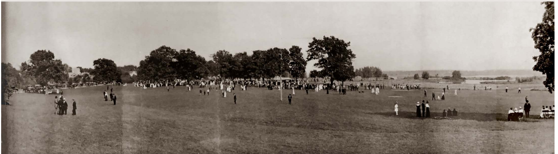
HENRY VILAS PARK