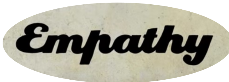
“Empathy vs Sympathy” by Brené Brown