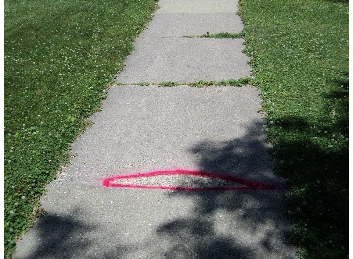
Voids and Erosion of Joints