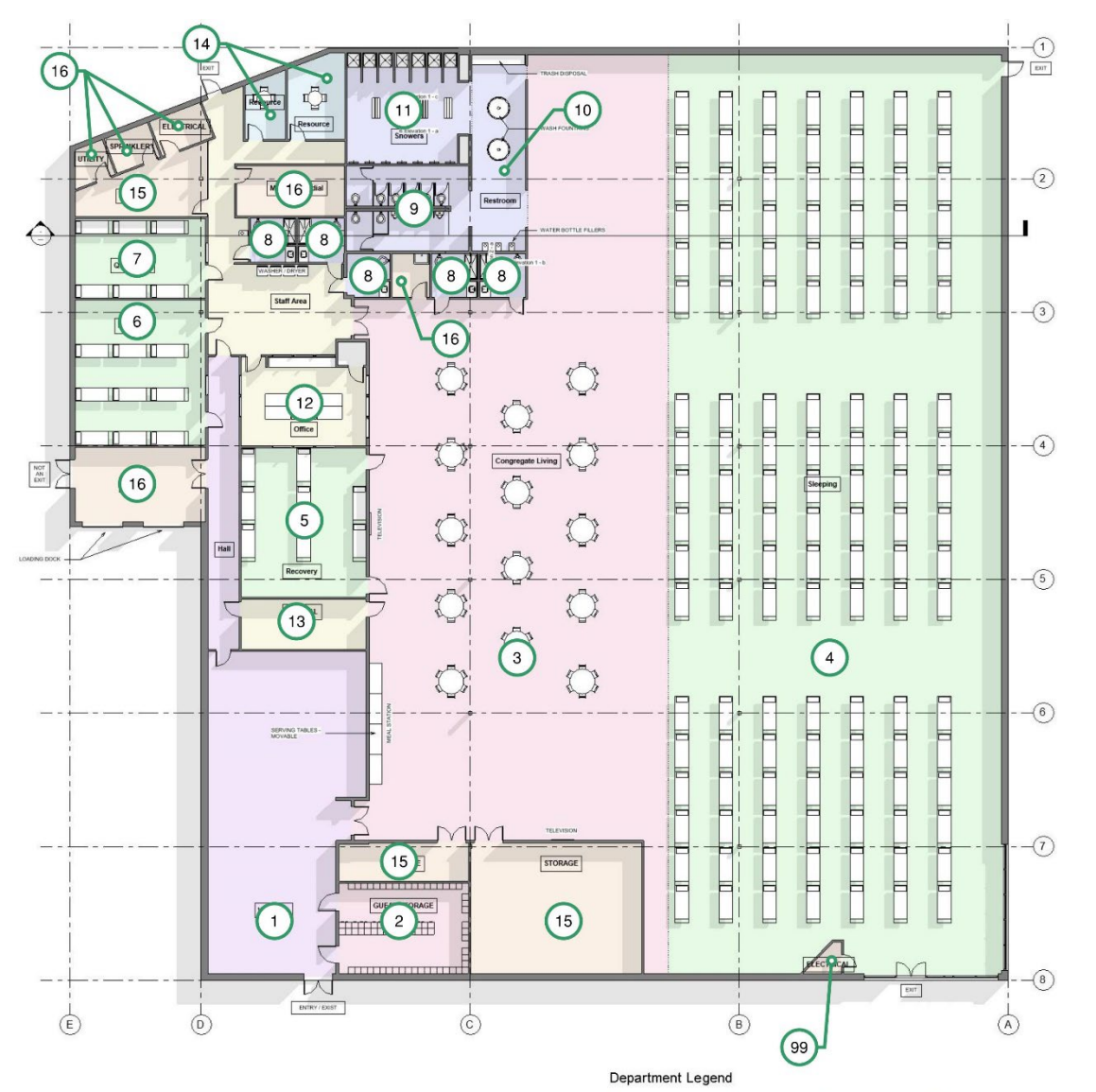
□ Criculation Spaces □ Living Area □ Outreach Spaces □ Restroom / Hygiene □ Facility Spaces □ Office Spaces □ Rest Area