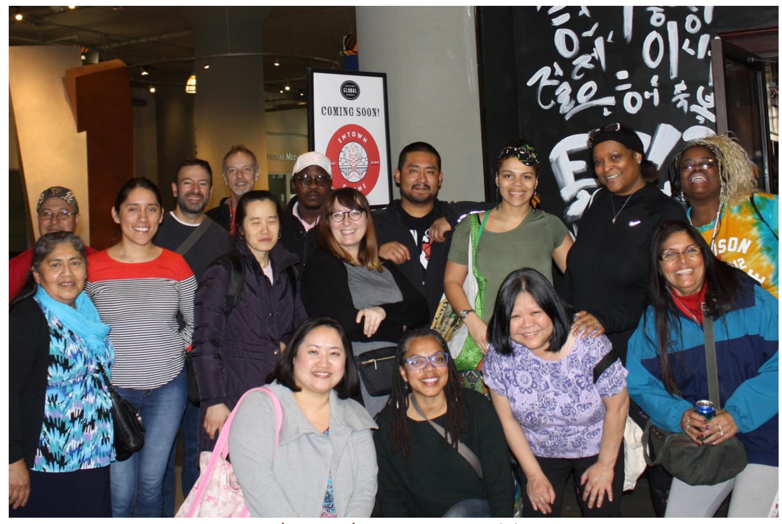
MarketReady Program Participants

Proposed program to expand opportunities for new entrepreneurs and existing businesses. Focuses existing and new resources toward communities that have historically faced barriers to accessing capital to start or grow a business enterprise.