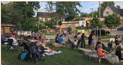
2017 Schenk-Atwood-Starkweather-Yahara Jackson Plaza Gathering Place