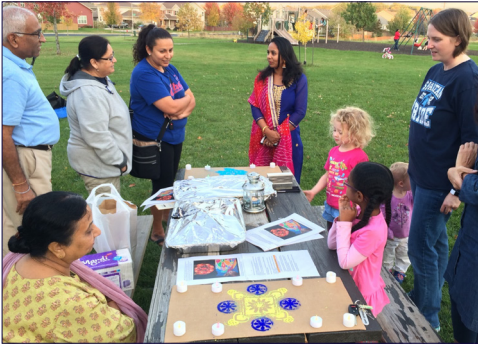
2017 Secret Places Dawla Celebration