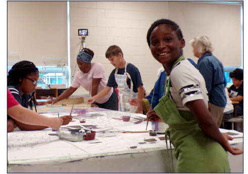
2019 Hawthorne/Truax E. Washington Tunnel Mural

Application Due March 2, 2020 by 4:30 p.m.*