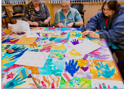
2019 Triangle Community Quilt