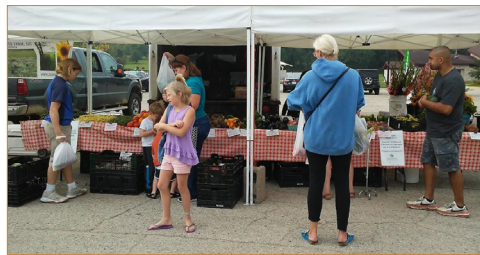
2018 Increase Affordability of Madison West Farmers Market at Elver Park