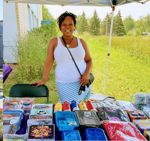
2020 Ujamaa Business Association Capacity Building