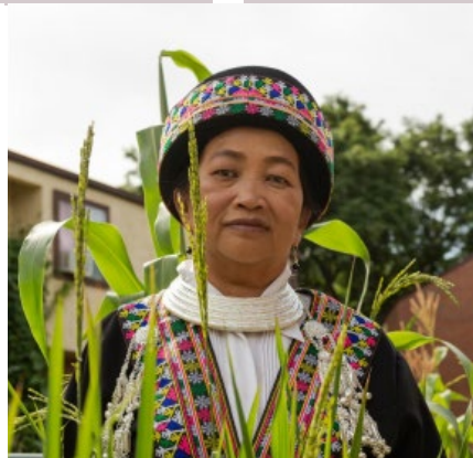
2019 BayView Portraits