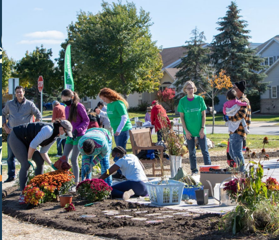
2021 Junction Ridge Park Patio

First session: July 9, 2022, 11:30-1:30pm