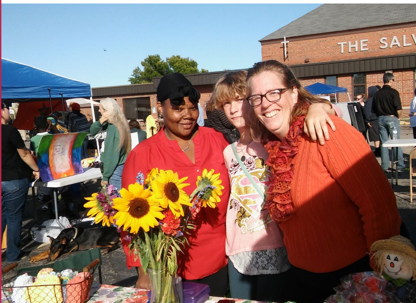
2017 Worthington Neighborhood Pop-Up Market