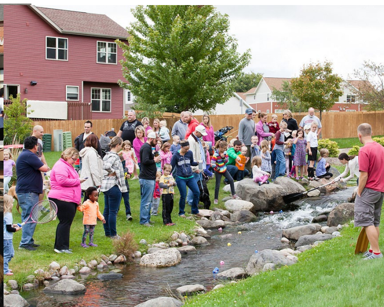
2016 Secret Places Neighborhood Pond Cleanup and Duckie Race