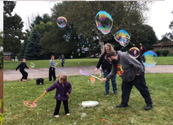
2018 Elvehjem 50th Anniversary